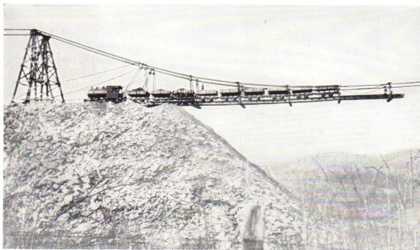
Building a railroad fill with a dumping cradleway. The abnormally severe loads which wire rope installations in such instances have to carry can be facilitated by the use of Caltex Crater. Caltex Crater will markedly reduce potential wear and maintain the tensile strength of all the strands by preventing rust and corrosion.

Yes, the above is an advertisement for Caltex Lubrications taken from a Caltex Technical Publication with no date. It's a lot older than I am. Is this how steel wire ropes were tested?