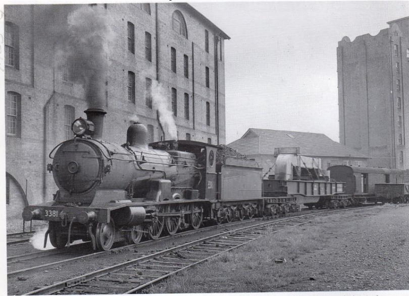
Heavy Lift 115 tons.

Special high capacity wagon T.W. 4400 is loaded with the first Broadside Mill Housing weighing 115 tons which is in the process of being conveyed from Sydney to Port Kembla. The photo is dated 22nd August 1950.