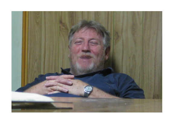
Santa ..... HO HO HO (N N N)

Do you know where this photograph was taken?