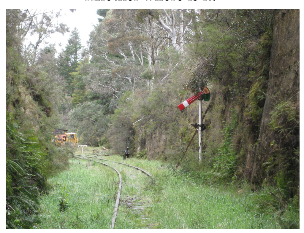
Another where is it?

The Tuesday Trainees without the photographer. Yes, the rooms are well used, other trainees welcome.